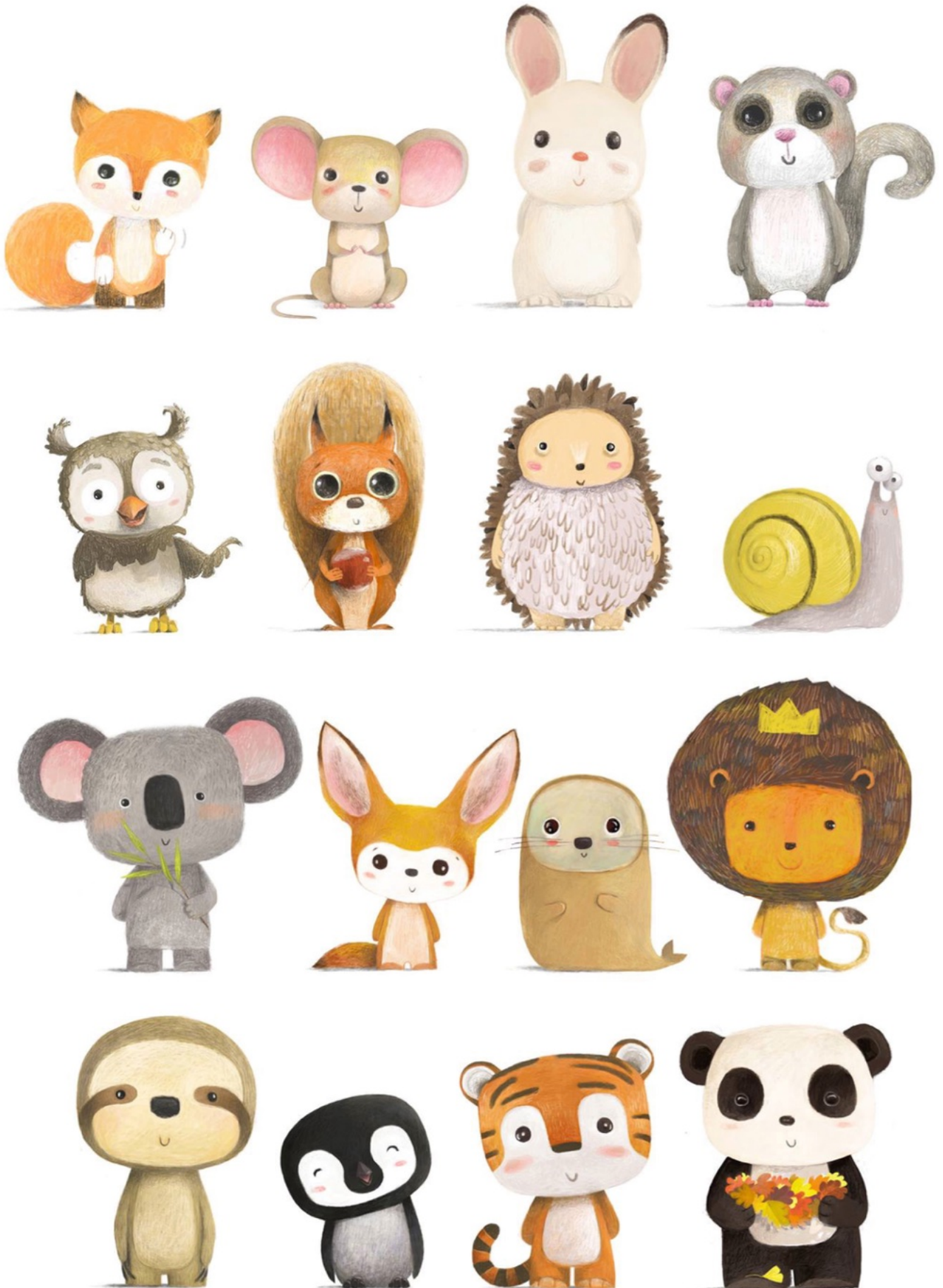
Personal, unpublished project: Mr. Lion and His Friends.