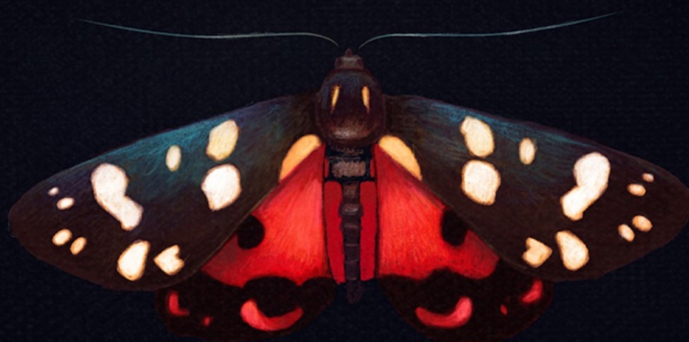
Illustrations from the exhibition V svetu drobnih življenj (In the World of Small Creatures), shown at the Velenje Cultural Centre in 2018.