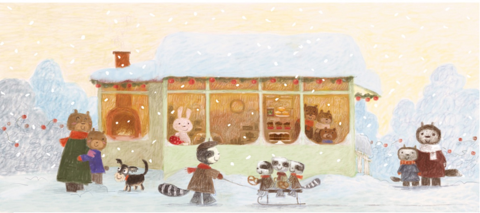
Illustrations, copywriting, and interior design for the bakery and patisserie 15 Süße Minuten in Vienna.