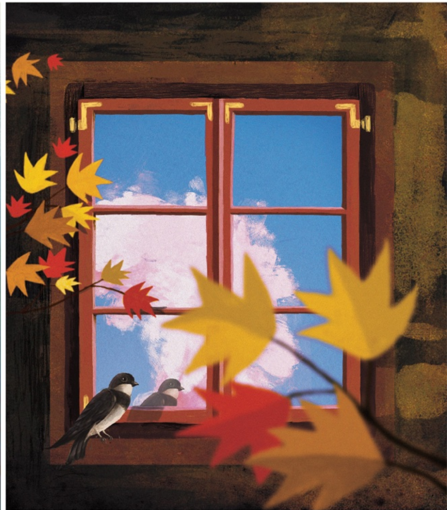
Illustrations for the Eka 4 Nature website (Italy), a deck of playing cards for North Star Toys (Kuwait), and a cover illustration for Goodlife Magazine, published by Delo (Slovenia).