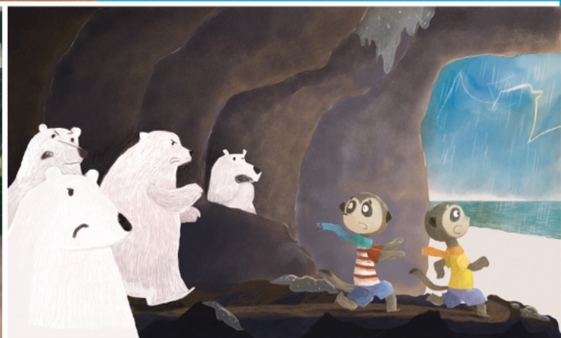
Illustrations from the book Para onde foi o verão? (Where Did the Summer Go?) by acclaimed Portuguese writer Álvaro Magalhães, published in 2023 by Porto Editora, the largest publishing house in Portugal.