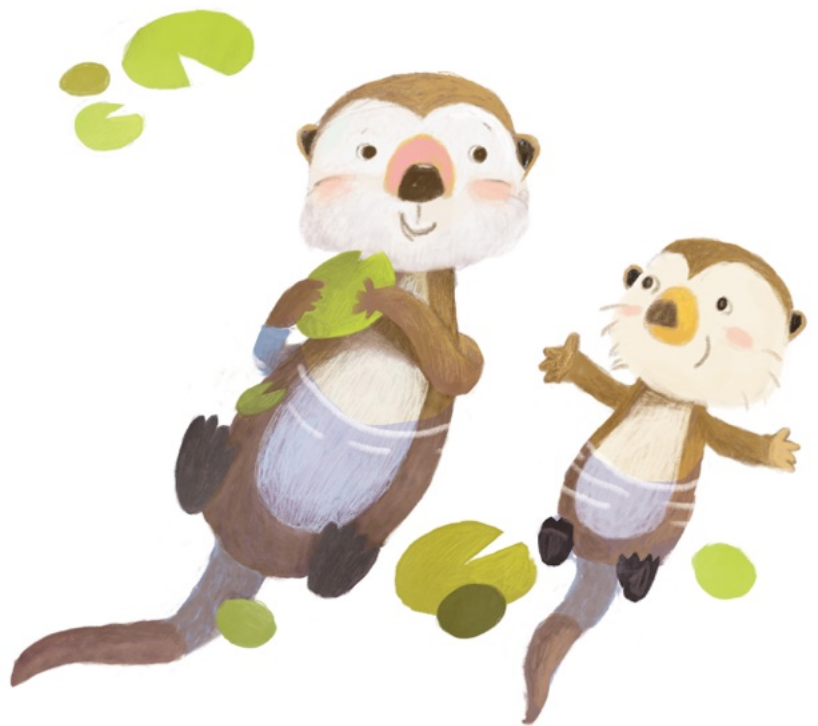
Illustrations for the Obie Otter story series by Troy Brownfield, created for the iconic children's magazine Humpty Dumpty Magazine. USA, 2024.