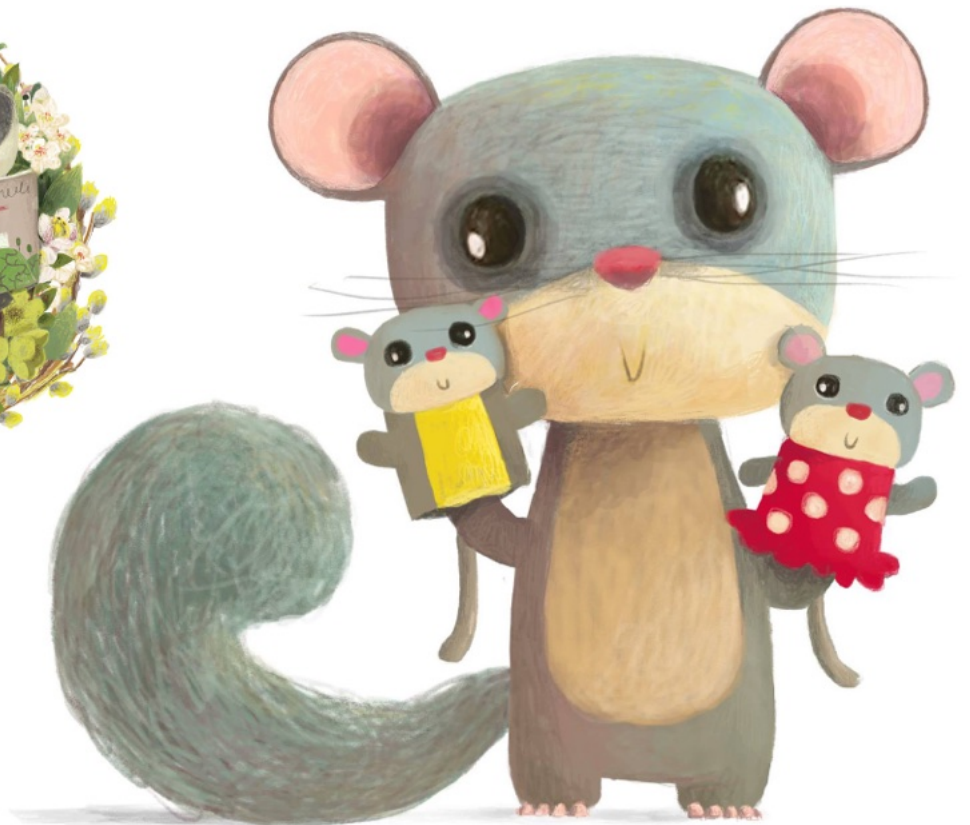
Promotional illustrations for the Swimholic swimming school (Switzerland), the Piccletto Kids reading-event series (Austria), and the children's theatre subscription program at the Cultural Centre Cerkinca (Slovenia).