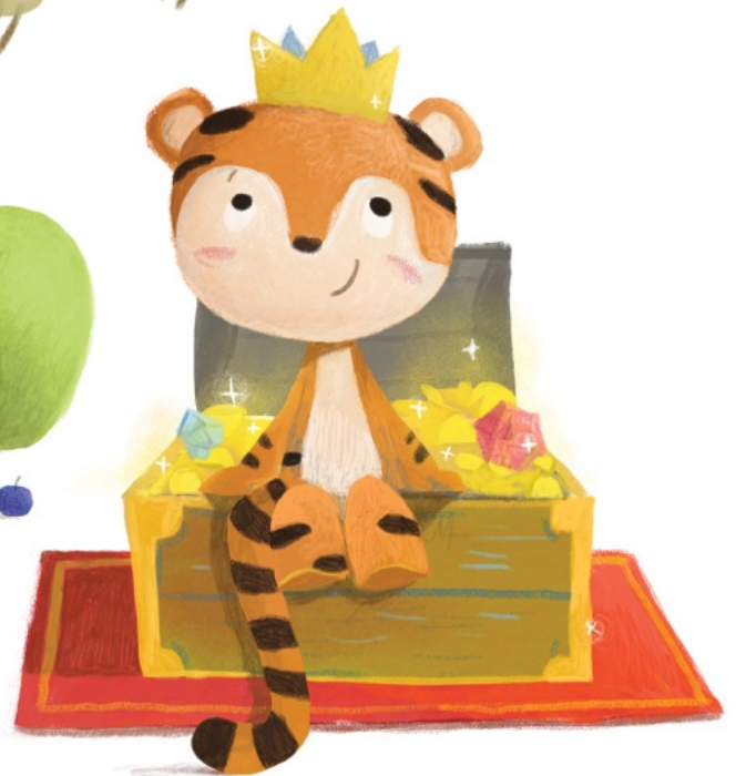
Illustrations for children's affirmation cards for Spriverton (Germany).