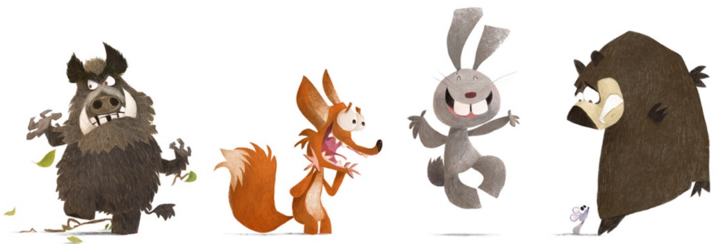
Illustrations for To the Adventure , an album by the South African indie rock band Lunatic Wolf; bird illustrations for the Posoški Development Centre; and artwork for the interactive educational game Spoznajmo gozdnosr(e)čneže , created for the Institute of Forest Pedagogy.