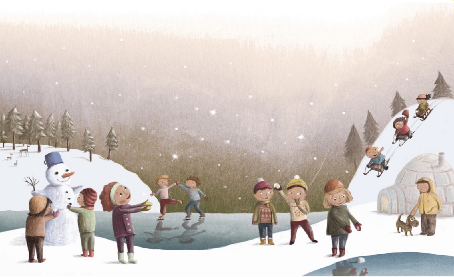
Two of the illustrations created for Ciciban magazine between 2013 and 2015.