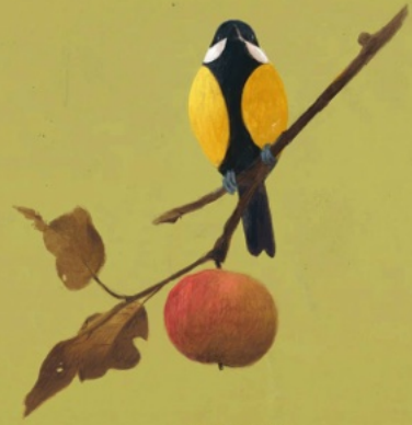
- PARUS MAJOR -