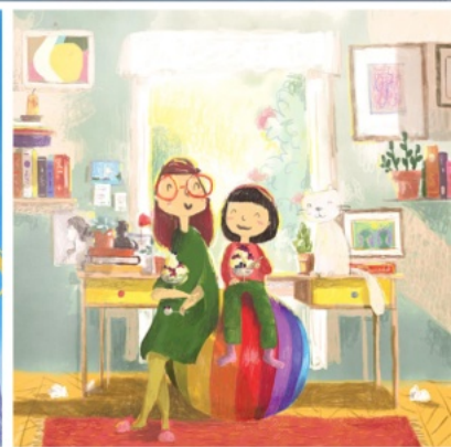
Illustrations for the internationally awarded audio-story project Lahkonočnice, created through a long-term collaboration with the Shift/Grey Agency for AI.