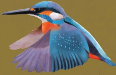
- ALCEDO ATTHIS -