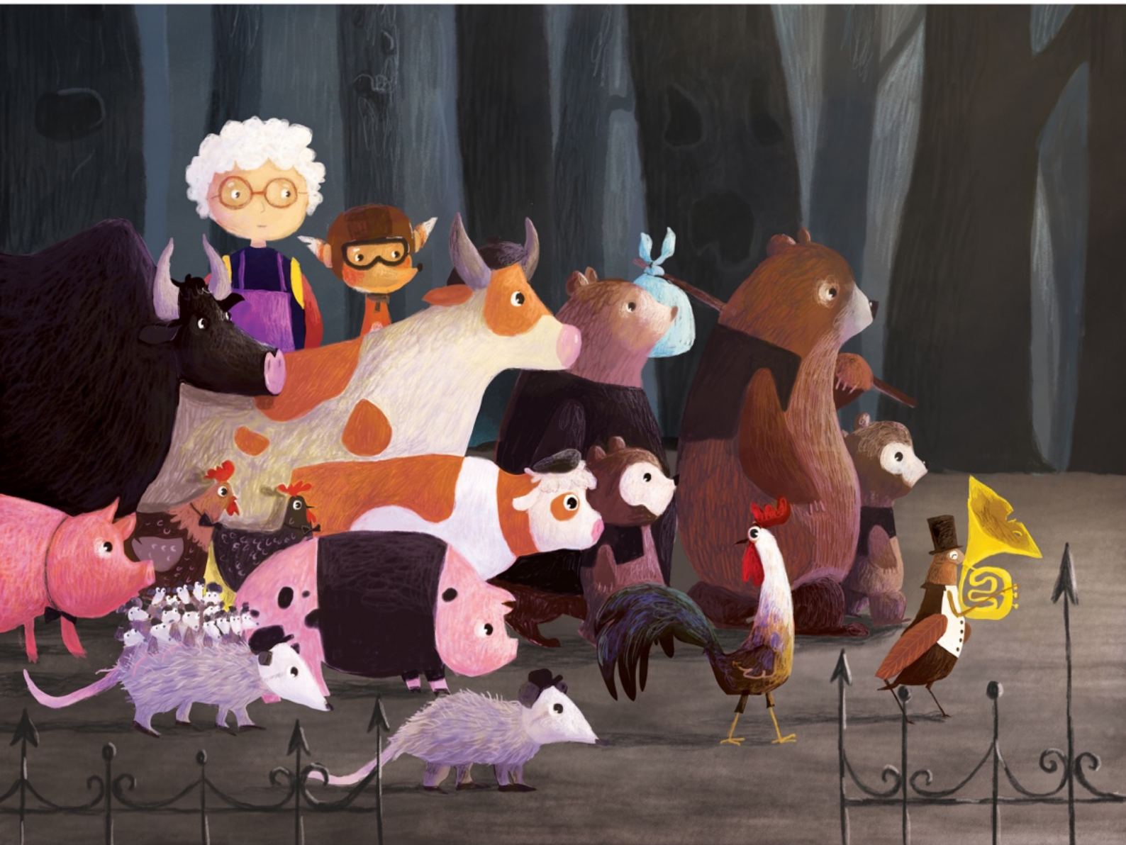
Illustrations from the book Mavrica (Rainbow) , written by Ivica Podgornik Vogrlič and self-published in 2023, and from the completed but not yet published picture book Babica, ki je ujela zvezdo (The Grandma Who Caught a Star) , written by Renato Švara.