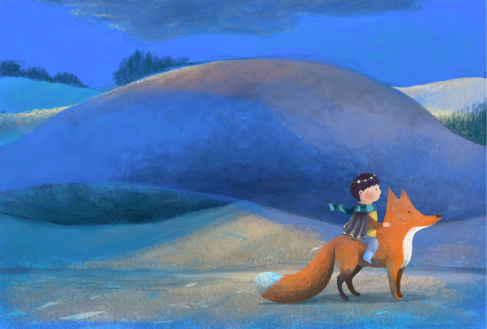
Personal, unpublished project: A Boy and His Fox.