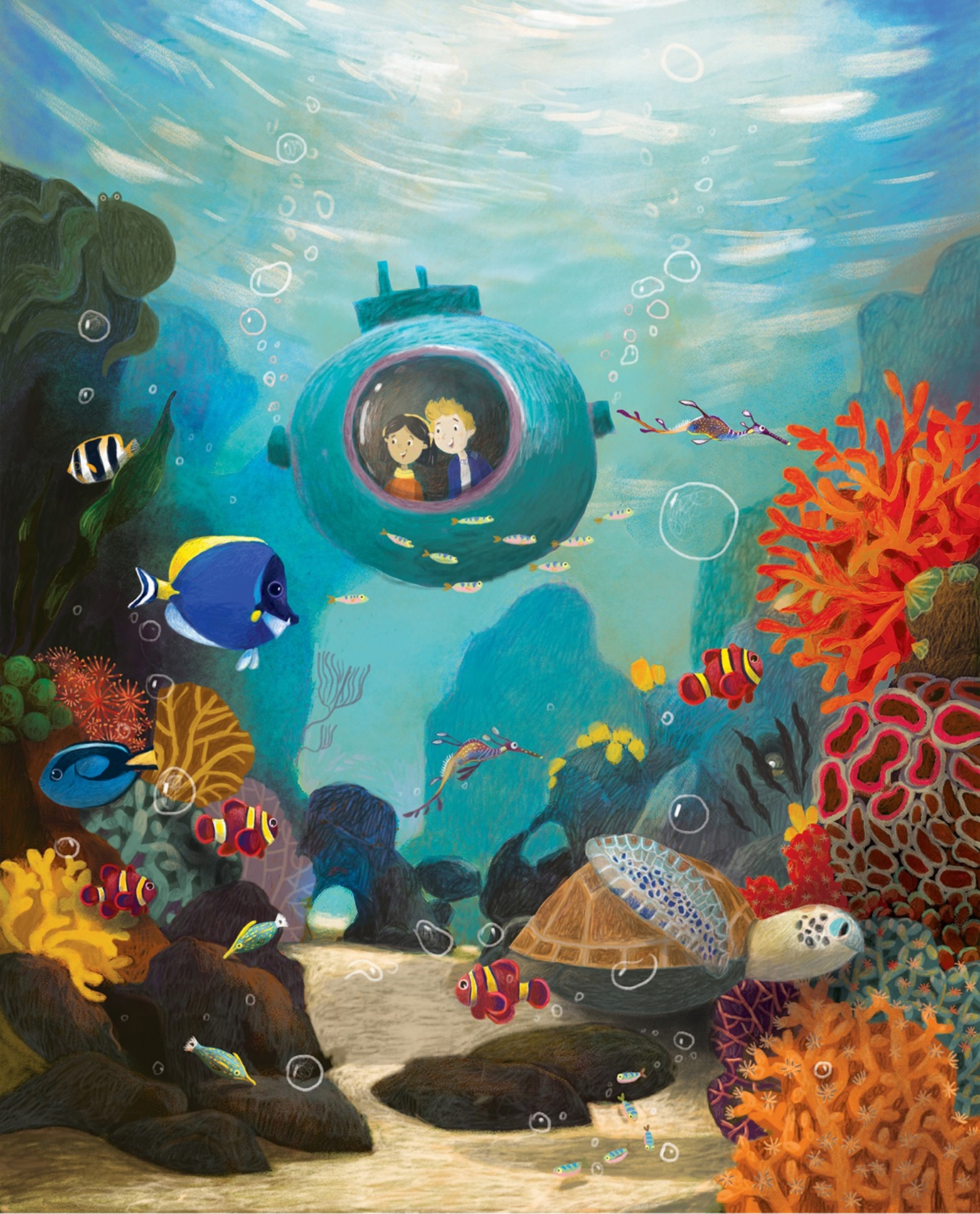
Illustration for the American children's magazine Jack and Jill , one of the oldest children's publications in the world. March/April 2024. Awarded a Certificate of Merit at the Society of Illustrators of Los Angeles – Illustration West 63.