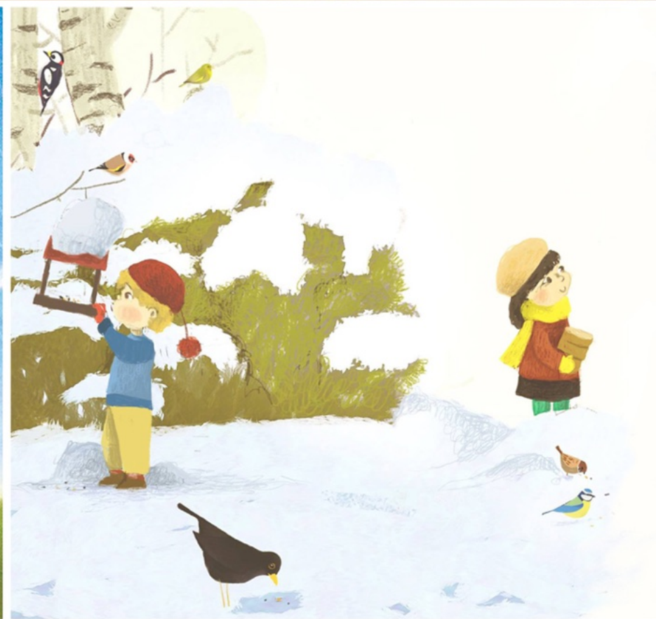
Illustrations for the children's magazine Galeb between 2015 and 2023.