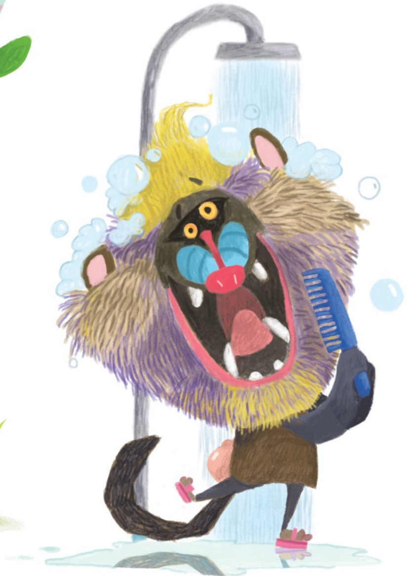
Illustrations from the book Kick it Like a Cricket by American author Viola Horne. The book was self-published in the USA in 2024.